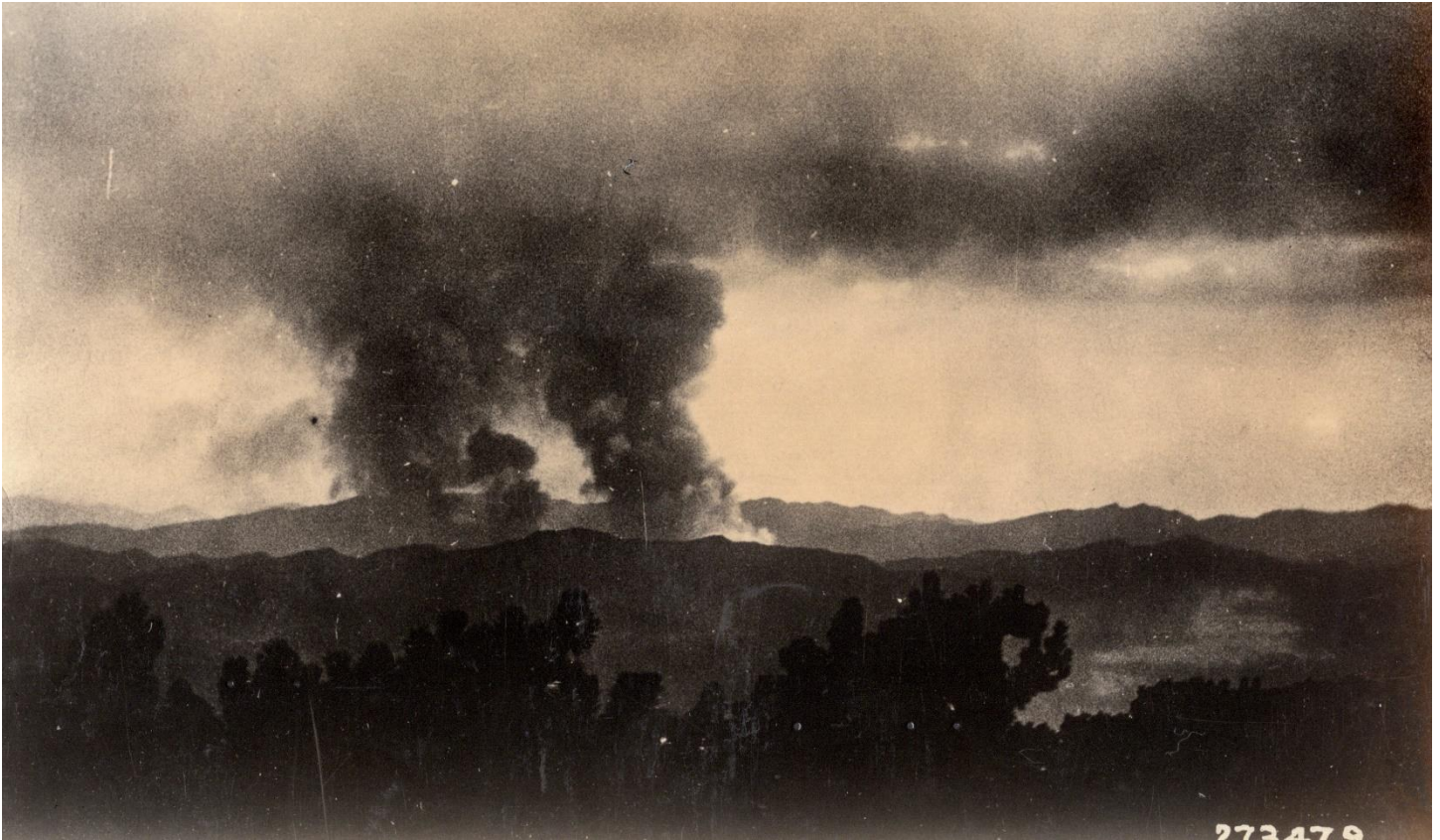
Matilija Fire – September 7, 1932 at 16:00 - Sespe Ridge in foreground