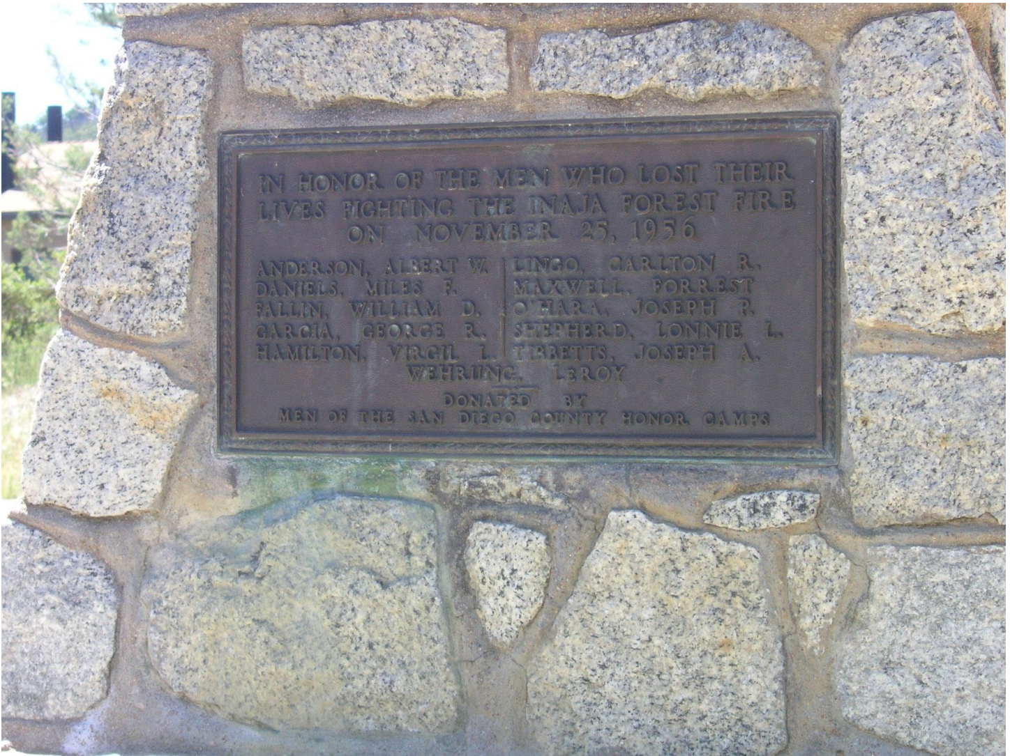
Inaja Memorial on Highway 78 near Julian, California.