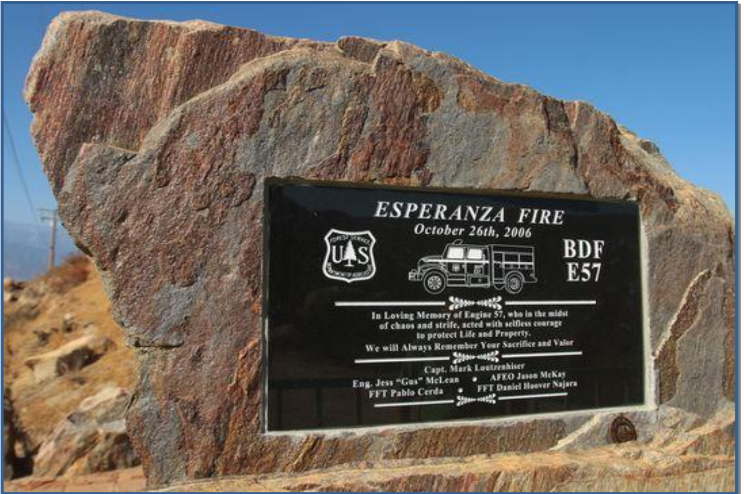
Memorial at the Octagon House