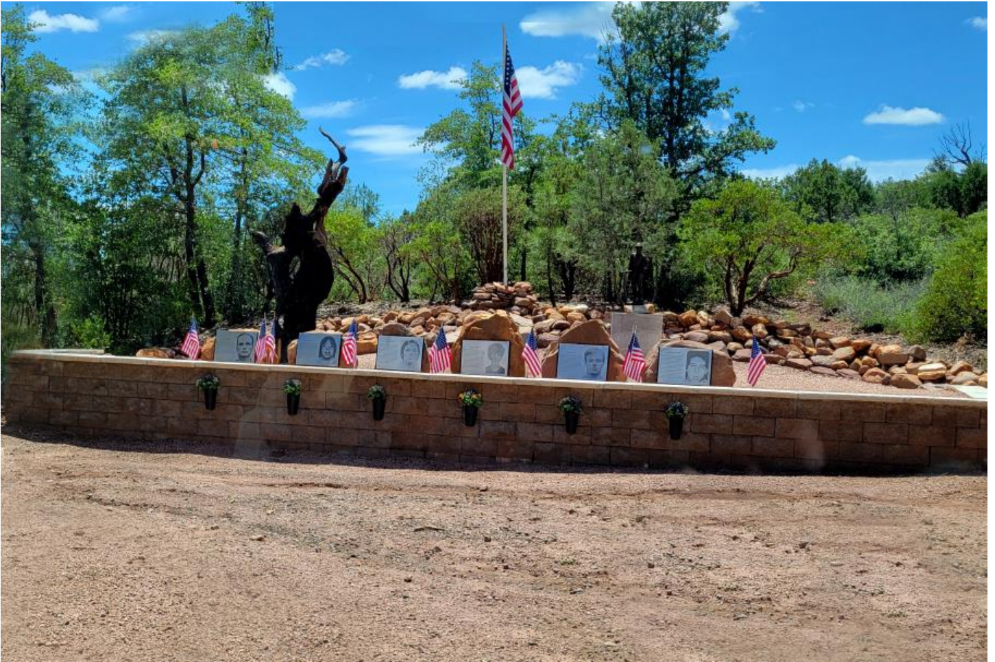
Memorial at the entrance of Bonita Creek Subdivision for the firefighters who perished on the Dude Fire in June 1990