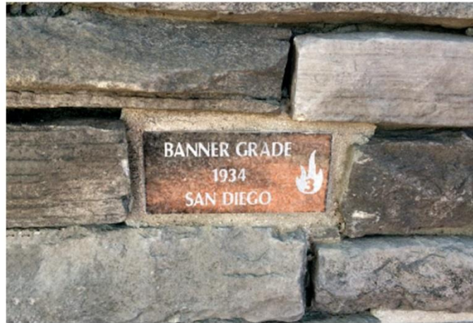
Banner Grade Fire inscription at the California Wildland Firefighter Memorial This memorial is located at the summit of State Route 74 in Orange County, California