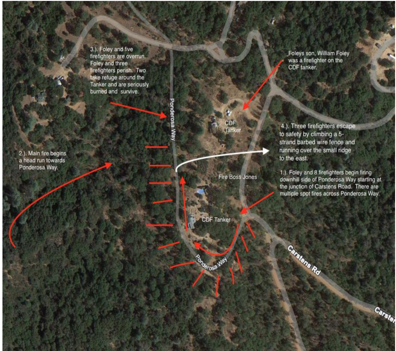
Timber Lodge Fire fatality site suppression actions