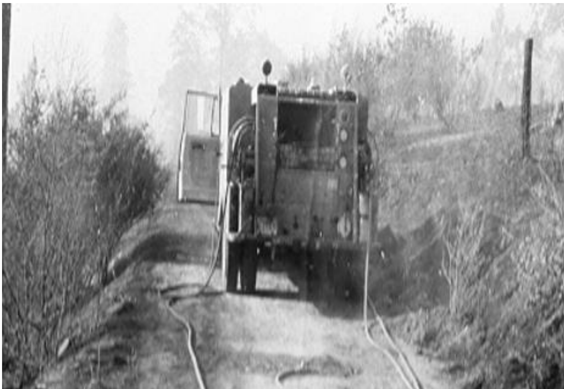
Jerseydale tanker after burn over...note the fuels on both sides of Ponderosa Way Hose lines were deployed due to tanker only being able to pump while stationary