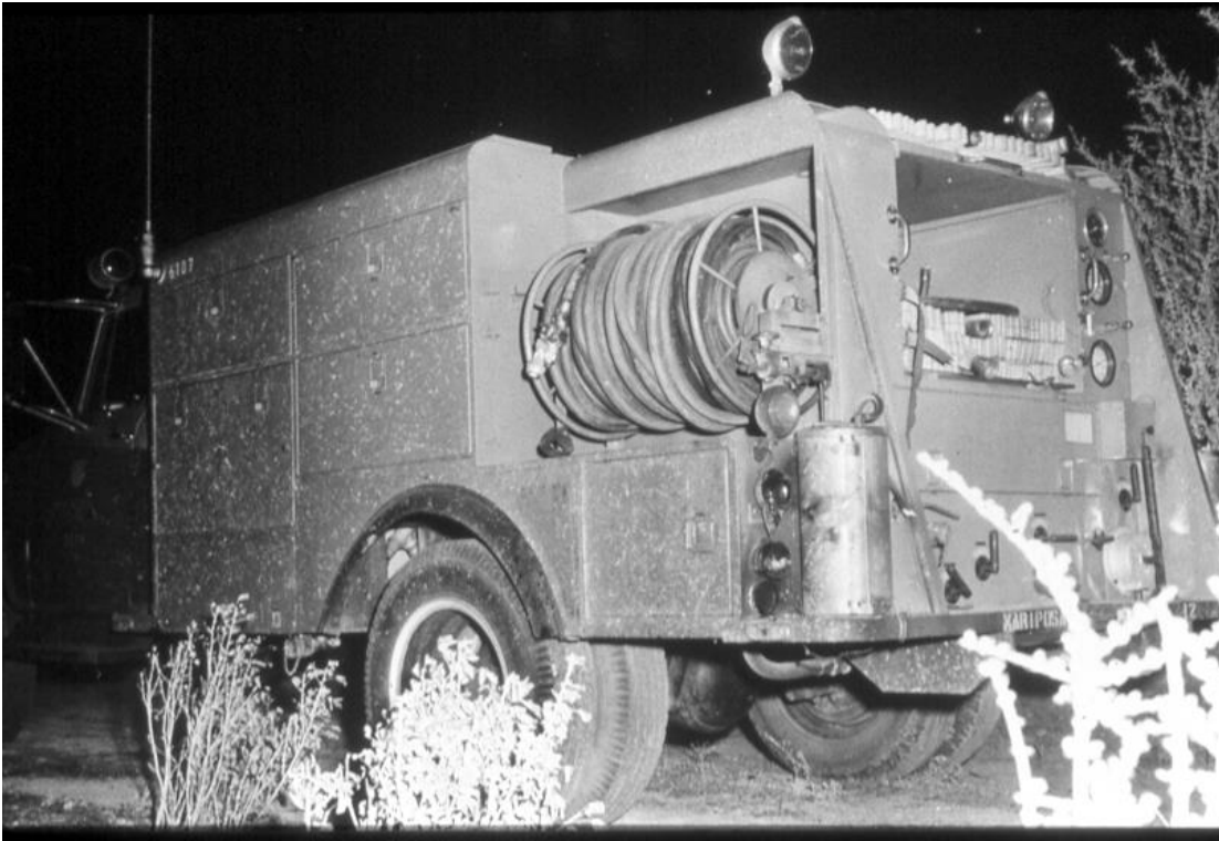
Hose bed where Chapin took refuge