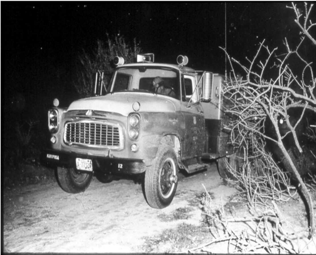
Front of the Jerseydale tanker