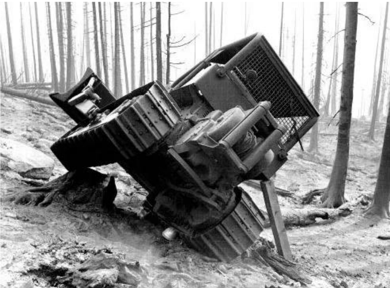
The dozer after the burn over. (Peterson, 2023)