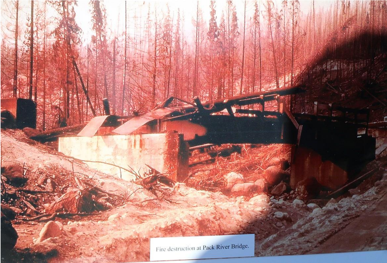
The fire damaged Pack River Bridge. Anderson infers that the fire reached 1200°F for the steel to warp under its own weight. (Caroline Lobsinger, Bonner County Daily Bee, 2017)