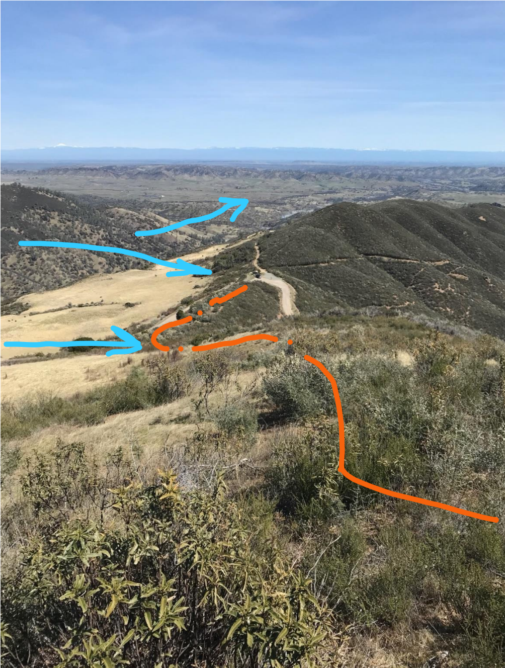
View looking Northeast from High Point to Powder House Turn

Orange line indicated completed handline/dozer line from High Point to Powder House Turn. This was the line Werner was firing when the Sundowner winds surfaced just after 2200. Blue lines indicate direction of Sundowner winds.