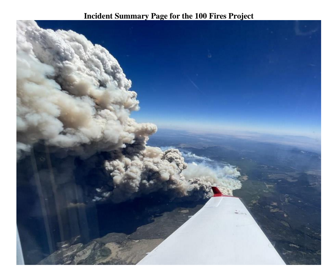
Fire activity on 06/14/2022