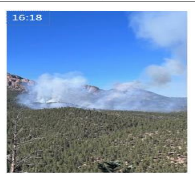
Figure 1: Gallinas-Las Dispensas Prescribed Burn on 04/06/2022 @ 1618