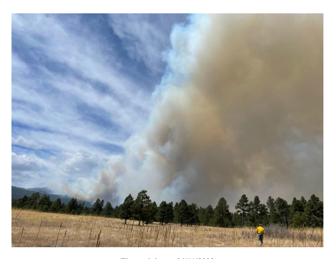
Fire activity on 04/11/2022