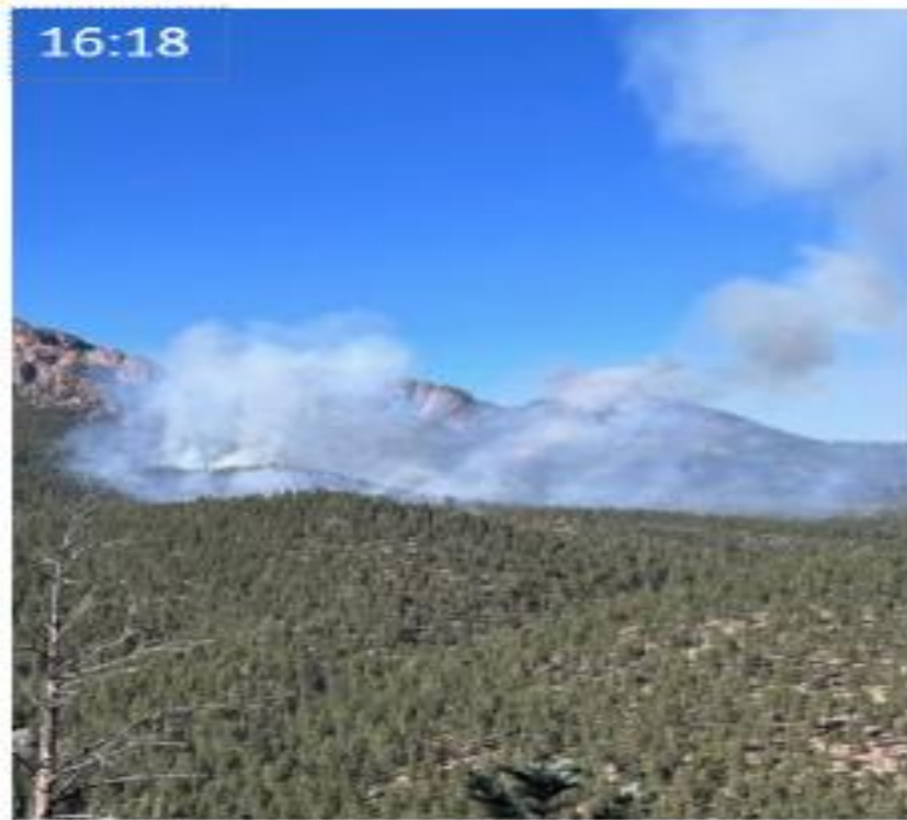
Figure 1: Gallinas-Las Dispensas Prescribed Burn on 04/06/2022 @ 1618