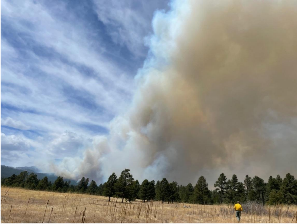
Fire activity on 04/11/2022