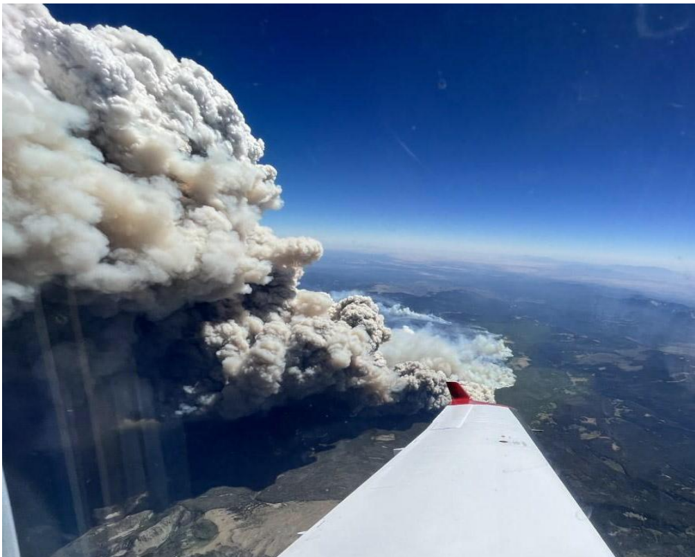
Fire activity on 06/14/2022