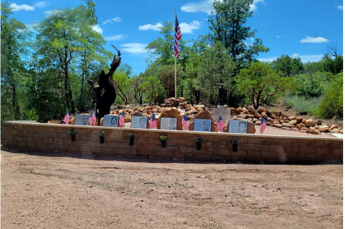
Memorial at the entrance of Bonita Creek Subdivision for the firefighters who perished on the Dude Fire in June 1990