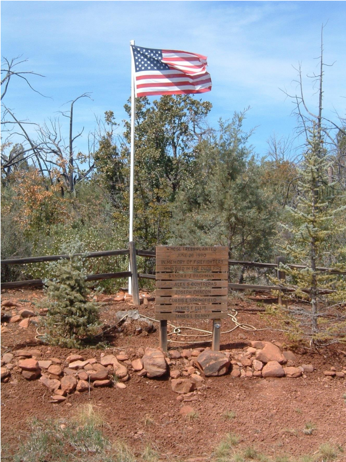
Memorial at the entrance of Bonita Creek Subdivision for the firefighters who perished on the Dude Fire in June 1990