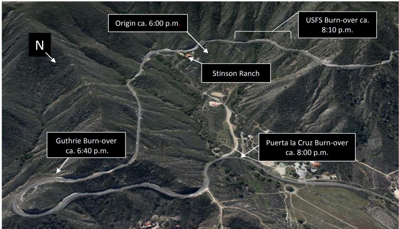
Figure 2. Google Earth satellite image of the mouth of Decker Canyon showing approximate location and timing of the fire's origin and the three burn-over events.