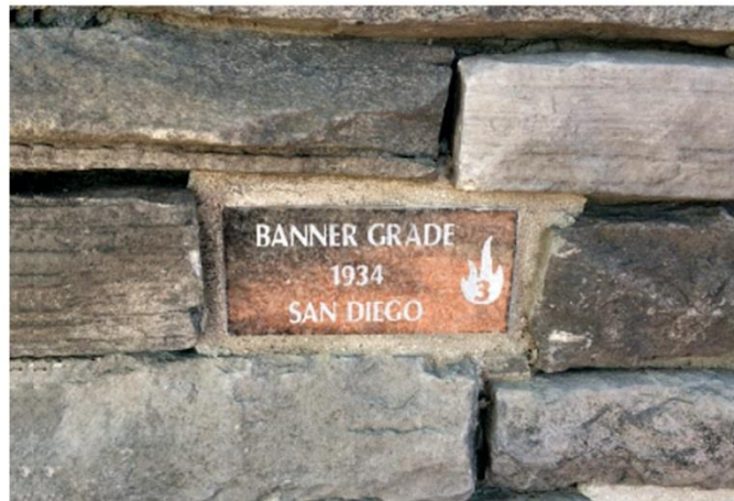
Banner Grade Fire inscription at the California Wildland Firefighter Memorial This memorial is located at the summit of State Route 74 in Orange County, California